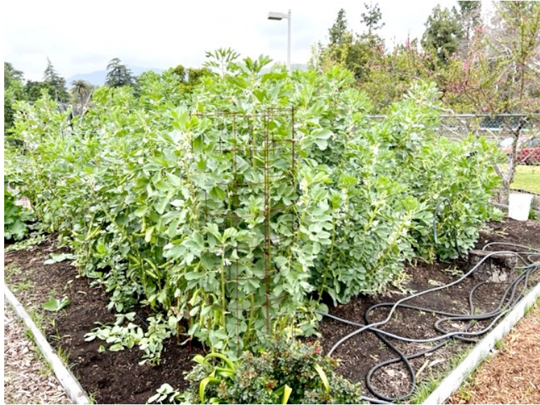
Fava Bean Bed

In the ensuing winter of 2022-2023, the second generation of seeds were sown requiring only weekly waterings with otherwise little to no maintenance. As record snow white-capped the San Gabriel mountains and copious rain inundated and carved out previously non-existent creeks, ponds and streams, the fava plants too danced in the deluge and drank, full of the nectars of spring.