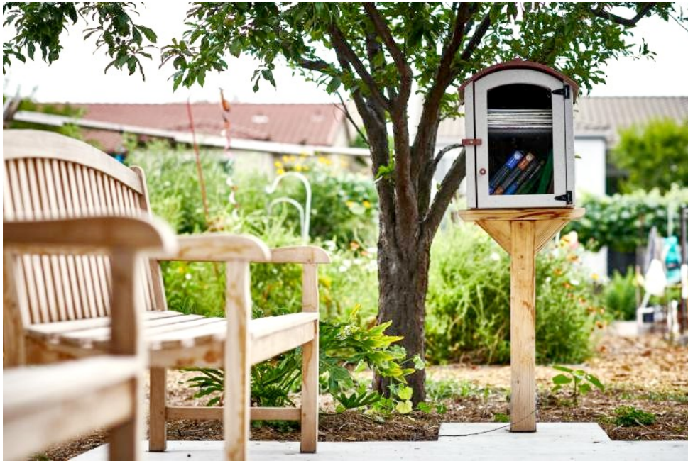
Our LFL Nook

A column centering on the Altadena Community Garden's Little Free Library