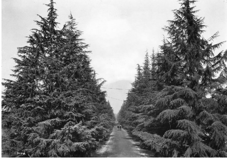
Christmas Tree Lane 1926