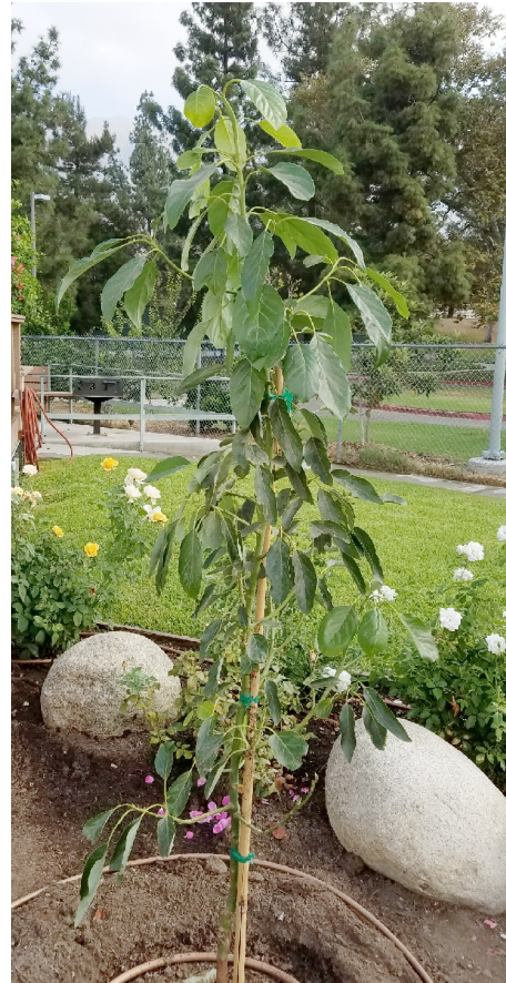
Our New Avocado Tree

We now have a ladder that belongs to the Garden. The ladder is in the large tool shed and is to be used in the Garden by Garden members. Please be careful when using the ladder and return it to the shed after using it.