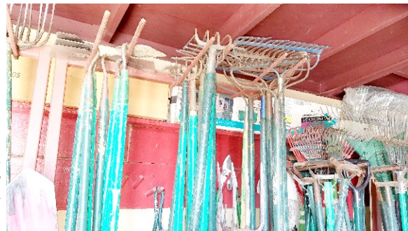
Tools replaced in rack

Please note everyone, that it's your responsibility to put the tools back correctly in the tool rack as shown in this picture. This is to avoid tools from falling from the rack and injuring another gardener who is attempting to remove a tool from the rack for his or her use. In correctly placing a tool in the tool rack, you can prevent causing serious injury to another gardener. Please take the time to put back the tools correctly in the tool rack.