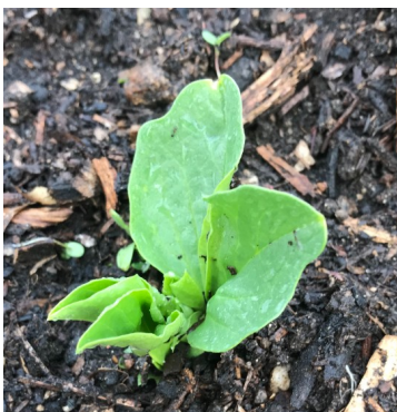
Fava Bean Plant.

– Ayesha Randall, Girl Scout Troop Leader