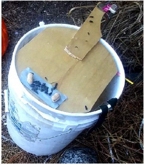
Cheap and Simple Multi-rat Bucket Trap

With the assistance of our squirrel traptesting team of experts which continue to be eager, tireless, dedicated and very effective research assistants, a number of weight settings and bait