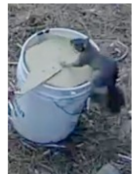
Trap tested by an expert

The use of a bulldog clip to position a counterweight to the trap door which tips on a fulcrum about <sup>1</sup>/<sub>4</sub> of the way across the mouth of the bucket, allows one easily to adjust the distance of the weight from the fulcrum and thus its mechanical advantage, providing full control over the resistance of the trapdoor.