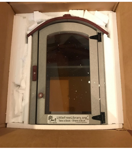
Our new LFL