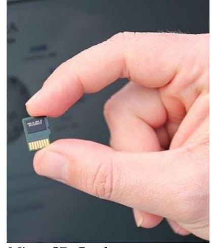
Micro SD Card

Though clearly the words-to-weight ratio of the paperback compared with that of the clay tablet seems mind boggling, it is, in turn, dwarfed by developments of the past decade alone. Readable by most smartphones, tablets or laptops, a micro SD chip the size and weight of one's fingernail can contain, as ebooks, the fully illustrated text of tens of thousands of books and that capacity is continuing to double every year or two. But far more importantly, the literature of all past centuries since the birth of written language is now accessible to anyone with such a device for free! From Thucydides to Thomas Aquinas, Shakespeare to Twain, Newton to Einstein, it's all there, with a fee required only for that recent segment which is still under copyright.