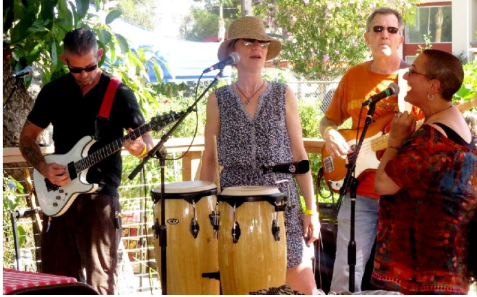
South Pasadena Transit Authority