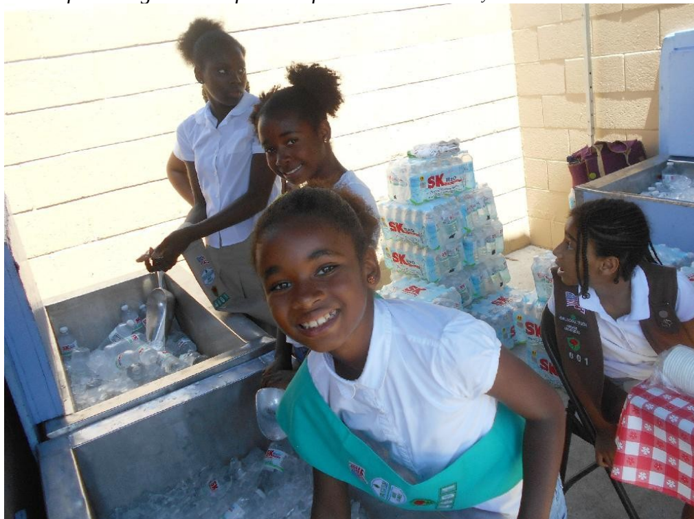
Scouts providing water to parched picnickers

During the year 2016, Troop 4601 worked hard keeping our herb garden weed free and fresh for the enjoyment of all garden members. This year we were unable to attend to the garden due to the hazards presented by the deck construction zone being so close. We do have a plan to bring our current herb garden back into splendor. We have some major work to address, starting with building up the soil. The girl scouts will be working in the garden on the second Saturday of each month.