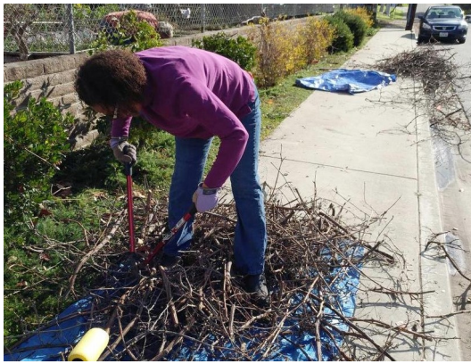
Cutting up the vines

Tools, water and snacks were provided and the atmosphere was most collegial and convivial as the vines were removed, cut up into small pieces, wheelbarrowed to the dumpster and stomped down. It was a very rewarding, if somewhat tiring, experience.