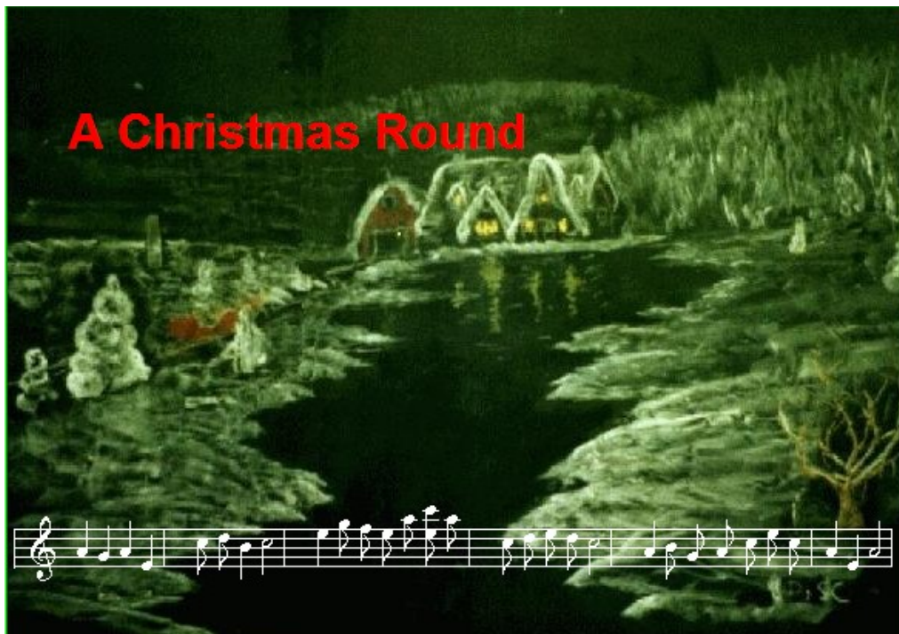
A Christmas Round. Each voice enters at the bar line.

This Musical Christmas Card contains a melody that may be sung as a round. Links reference an mp3 of the melody and recordings of two choral settings.