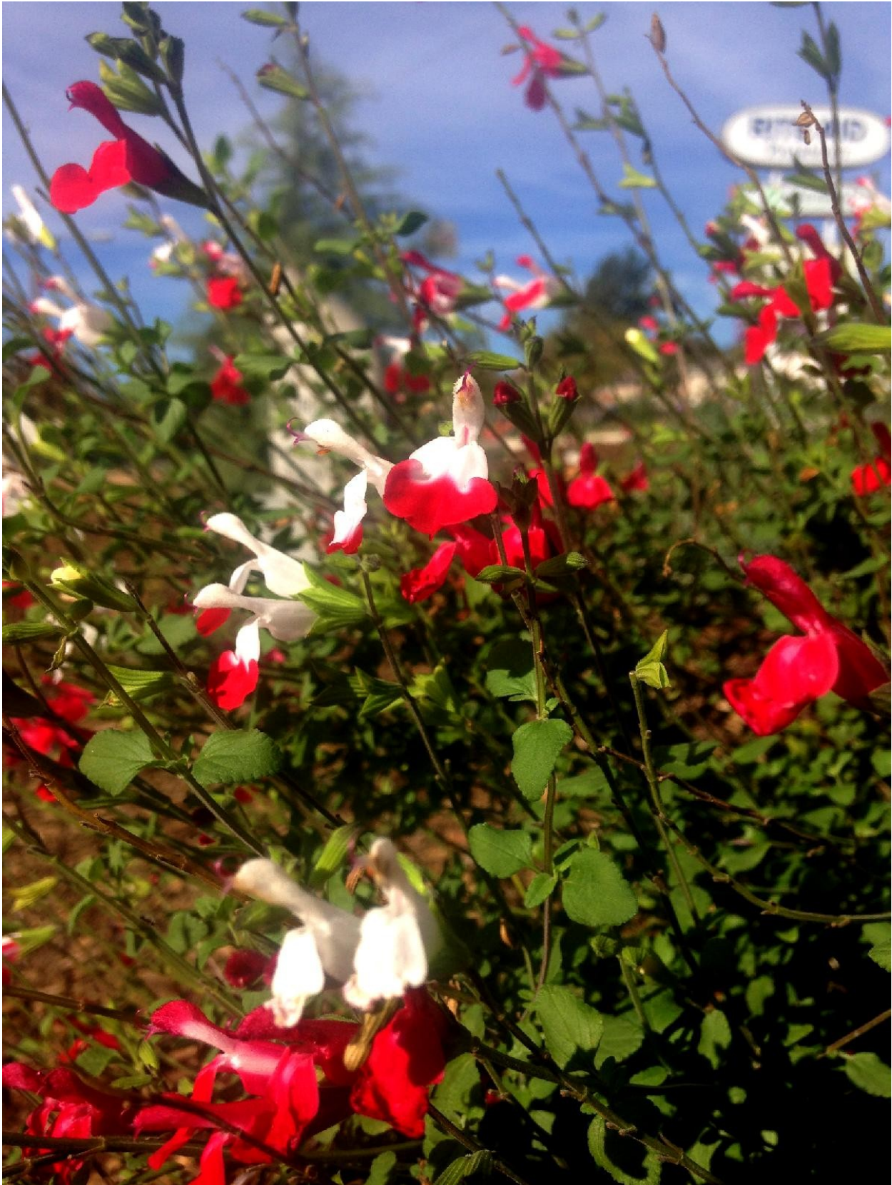
“Hot Lips Salvia” Plant at the new Altadena Triangle Park